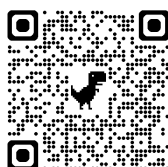
Dane Fredericksen Analytical Chemist

**Verify the validity of test results by contacting support@foreveryoungpharmacy.com**